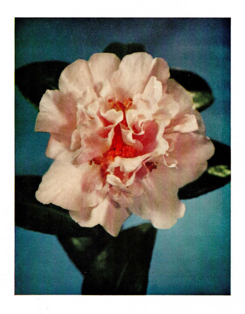
Camellia Hybrid BONNIE MARIE